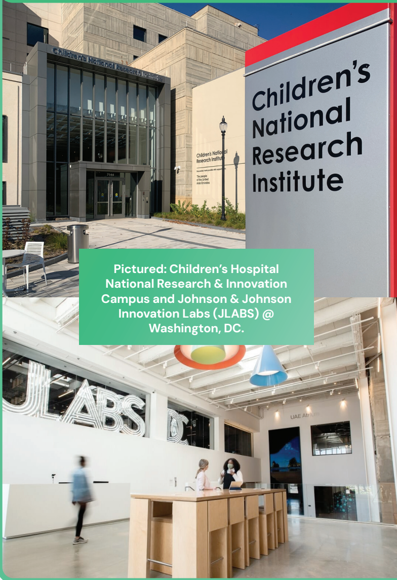
Pictured: Children's Hospital National Research & Innovation Campus and Johnson & Johnson Innovation Labs (JLABS) @ Washington, DC.

DC-based CaryHealth was founded in 2017 by pharmacists and technologists with extensive healthcare experience on a mission to deliver personalized digital healthcare experiences at scale to benefit all. In 2024, it ranked #82 on the Inc 5000 list of fastest growing business as well as #2 for artificial intelligence and #1 within DC.